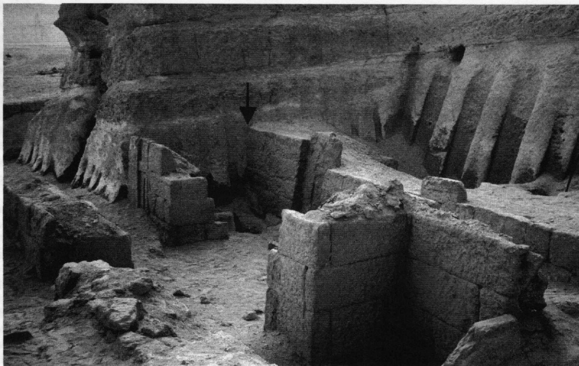
Fig. 5. Tombs, with architecture typical of the Fourth Dynasty at Giza, built against the east-facing façade of the tomb of Kai. At the position arrowed, the niched façade of the tomb of Kai had undergone significant degradation before apparently Old Kingdom tombs were constructed.