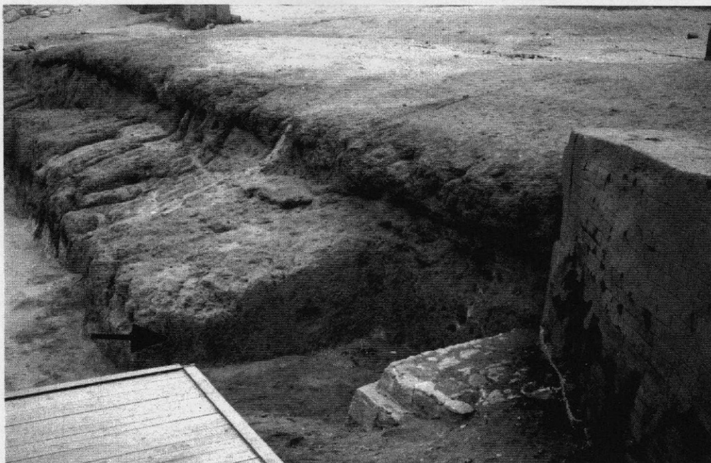
Fig. 4. The western limit (arrowed) of the Fourth Dynasty excavation (foreground) in Member I rocks within the Sphinx enclosure. Note the more heavily degraded Member I strata (background).