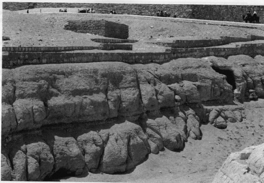
Fig. 3. Degradation of the western wall of the Sphinx enclosure.

The degradation of the walls in the western end of the Sphinx enclosure has few, if any, parallels within the Giza Necropolis. Furthermore, the processes responsible for this anomalous degradation had, over a scale of tens of metres, a selective or restricted effect on the exposed limestone beds, a characteristic, which is not generally associated with chemical weathering or sand abrasion. It is argued, therefore, that the development of this characteristic degradation requires the action of processes of erosion or weathering in addition to those that have been cited in support of the Fourth Dynasty date for the Sphinx.